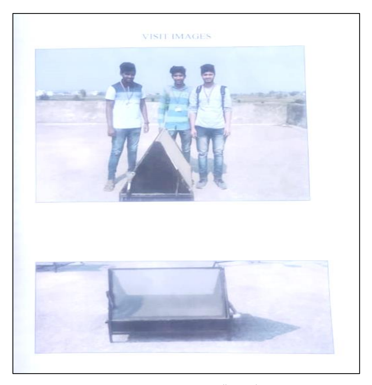
Demonstration on Water Distillation Plant